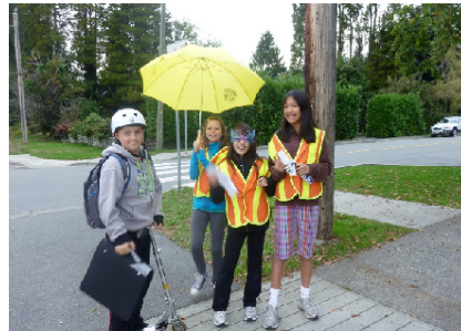
École Pauline Johnson students volunteered as traffic monitors during last year's International Walk to School Week.

If you have not already registered your school for iWalk, it's not too late! The registration deadline has been extended so schools can still register online until September 12 and ensure they receive their resource packages. Schools can register after the deadline but supplies may be limited. Click here to register now.