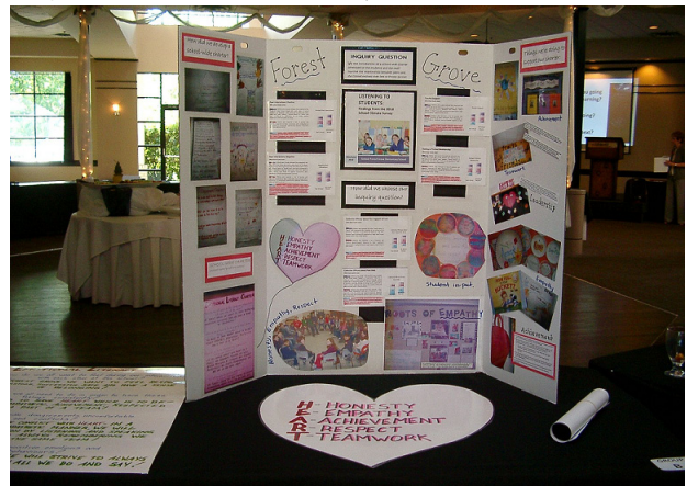
Healthy Schools Network members share their experiences through posterboards and get together at the end of every year.

The Healthy Schools Network (HSN) is a voluntary organization of BC schools established in 2006 to address a variety of academic, social and emotional concerns of students through a Comprehensive School Health (CSH) approach. Using innovative evidence gathering and inquiry-based learning frameworks, HSN schools put the CSH approach into practice. Interested in becoming a member or learning more? Contact us today!